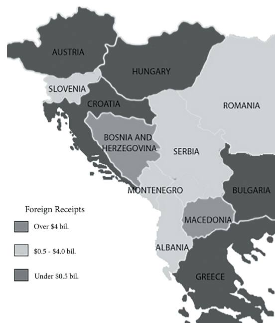
Figure 1. Extended Balkan Region by Receipts.

The region selected for the analysis is based on the neighborhood criteria, so called "Extended Balkans", and comprises the countries that are immediate neighbors of Serbia and former Yugoslav republics, which are geographically located in the Balkan region. Austria is added to the list because of its proximity to the region, as well as for its leading role as a tourism destination, as shown in Fig. 1.